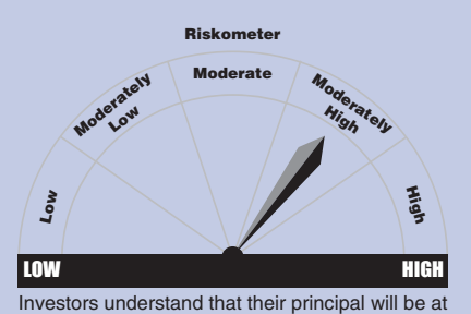
Moderately High Risk

*Investors should consult their financial advisers if in doubt about whether the product is suitable for them.